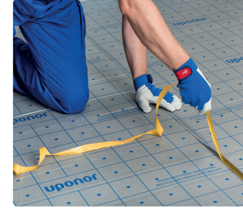
Self-adhesive strip along the panel for quick butt panels connection just remove the safety tape and connect the panels.

The Uponor Tacker floor solution offers footstep-noise insulation in accordance with modern requirements, and it can be constructed with, for example, pumped screed or a steel-reinforced concrete slab. The pipe-installation distance depends on the heating/cooling power need.