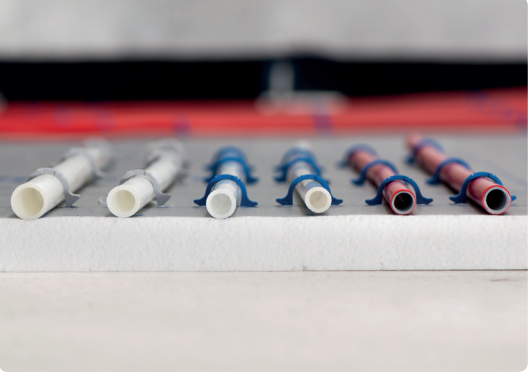
Two different pipes in different dimensions available.