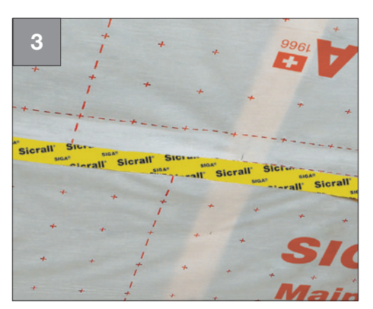
How it should look:

• The overlap is sealed with Sicrall 60 and permanently airtight